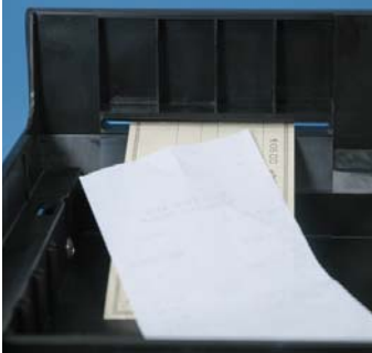
Checks And Card Slips Can be Inserted into the Media Slots Without Opening the Drawer