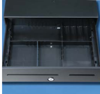
Configure the Storage Area to Your Needs Using the Adjustable Partitions Provided