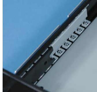
Drawer Glides Effortlessly on Side Rails with 24 Steel Ball Bearings per Rail