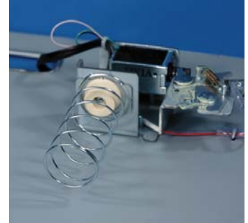
Heavy Duty 2-Stage Latch Mechanism